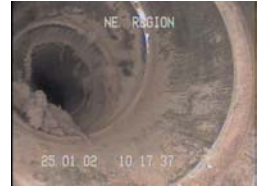
Image of a faulty liner in a chimney using the 2" P&T camera

View of a joint in a 4" dryer vent using the 2' Pan & Tilt camera